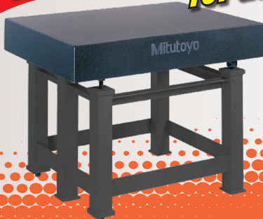
GRANITE SURFACE PLATE & STEEL STAND

Bonus Offer!! for additional $23. 67 Per Month when Leasing A.C.T. # 280208